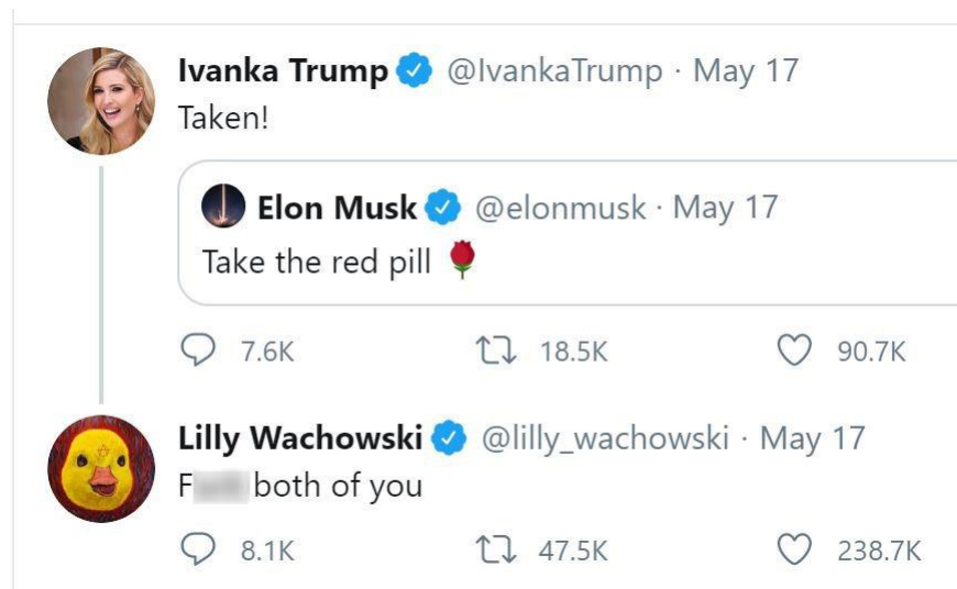
Figure 4: Lilly Wachowski replies to Ivanka Trump and Elon Musk, 17 May 2020 (Pulver, 2020). NOTE: This image has been modified to censor possibly offensive language.

“The red pill,” for example, entered the language as a reference to The Matrix (1999), in which a man living inside a simulation breaks out into the real world. The phrase “red pill” came to mean “opening your eyes to a fact you’ve been ignoring.” In May 2020, however, Elon Musk tweeted “Take the red pill” and got cursed at by the screenwriter of The Matrix .